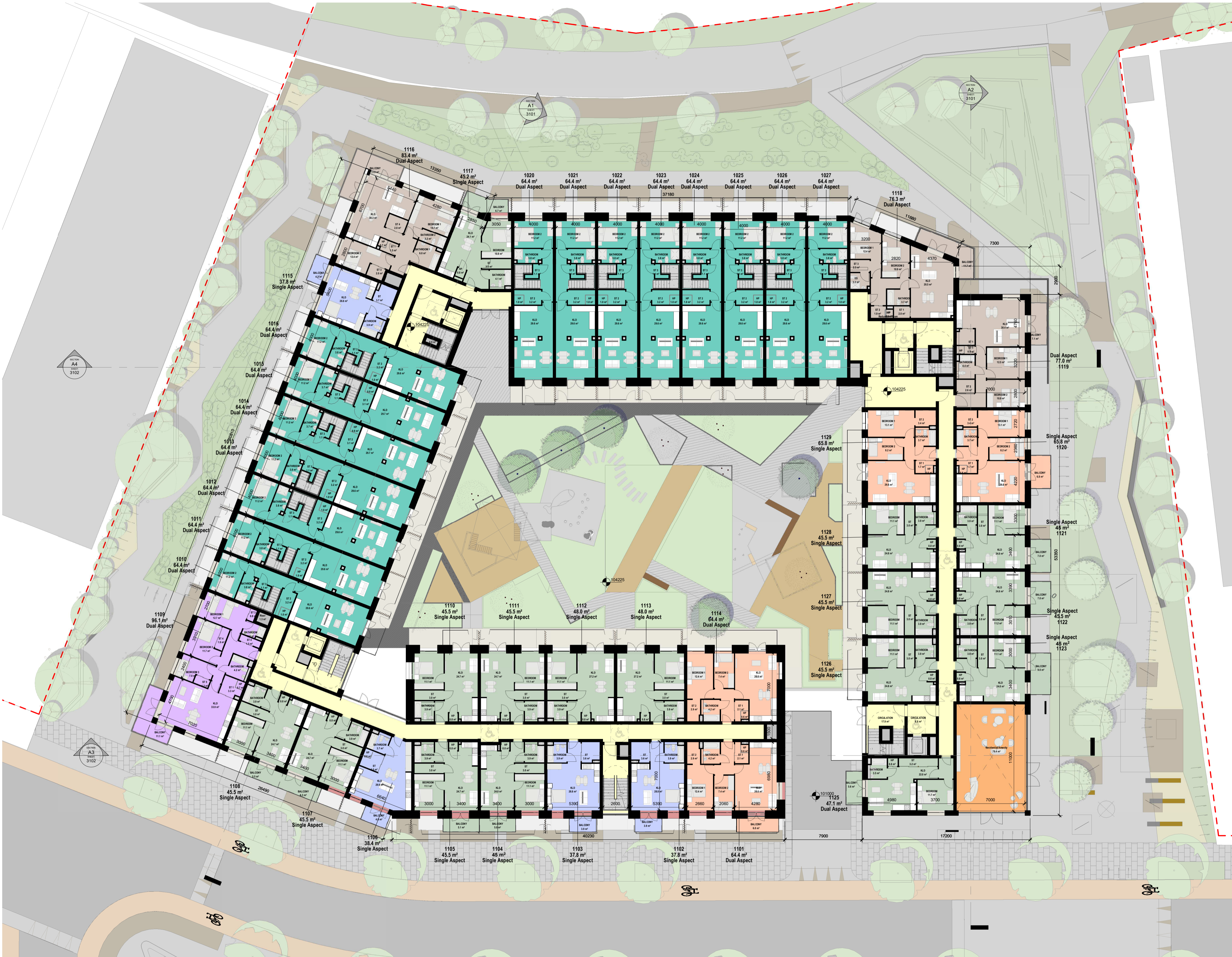
1 Plan - Block A - Level 01 1 : 200

Please consider the environment before printing this sheet